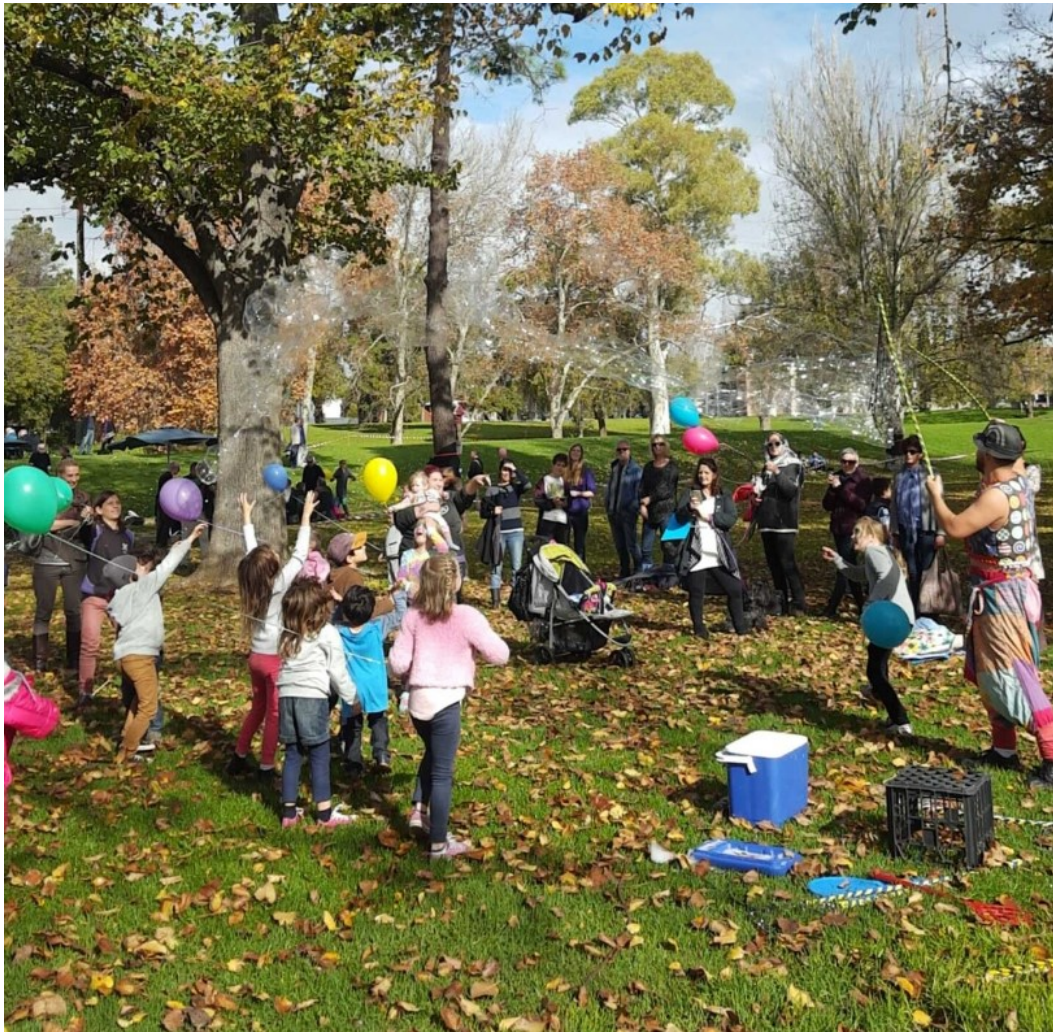
Children enjoying balloon artist at the 'Save Rymill Park Picnic Rally' 31 May

Since the 'Save Rymill Park' Picnic Rally on 31 May, the fight to save Rymill Park has undergone a number of twists and turns.