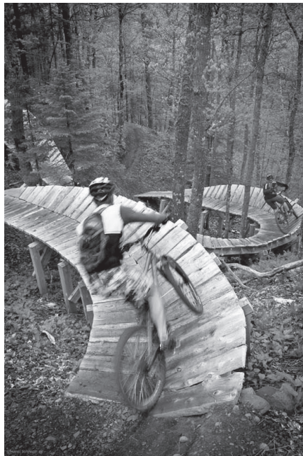
Could this be a feature in the Park Lands by 2036?

This got me asking, 'but how do we rejuvenate the Parklands and what are suitable developments for the city's green belt that will attract a wider repeat audience?' To answer these questions I looked at what is already great about our parks and what is great about parks I have seen around the world and the