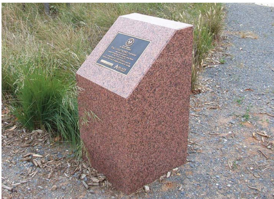
The Livestrong Pathway 'directional sign' which doesn't really give any indication of direction, either from the pathway or from the road. It looks like a substantial monument/plaque. Photo taken by Gunta Groves, 6 November 2011.

Unlike buses, if a tram breaks down, the others find it difficult to go around it. Face it, trams are Rann's way of creating himself a legacy and an apt one at that: They're very visible but next to useless.