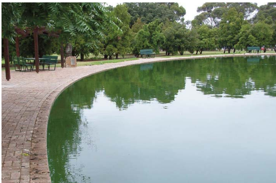
Above: The Bonython Park pond for model boats is open for business once again. Photo taken by Gunta Groves, 6 November 2011.